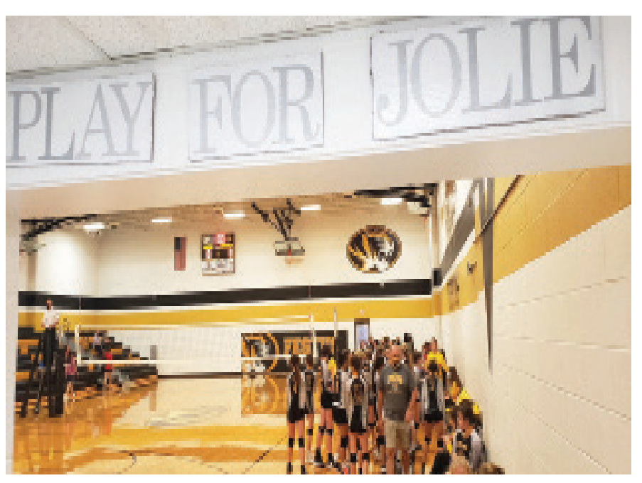
A "Play for Jolie" sign hangs above the athlete entryway to the FMS gymnasium.