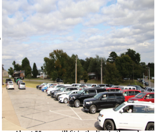
About 55 cars will fit in the line in the parking lot at one time