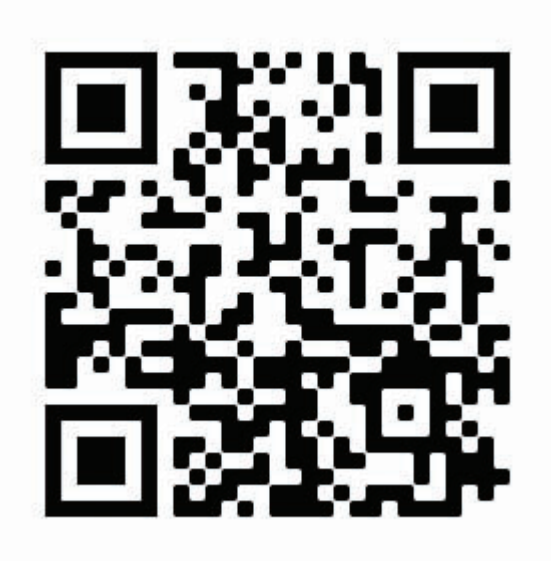
The Tiger Team Store is now online. Visit us at: https://festustigerteamstore. square.site/ or scan the QR Code