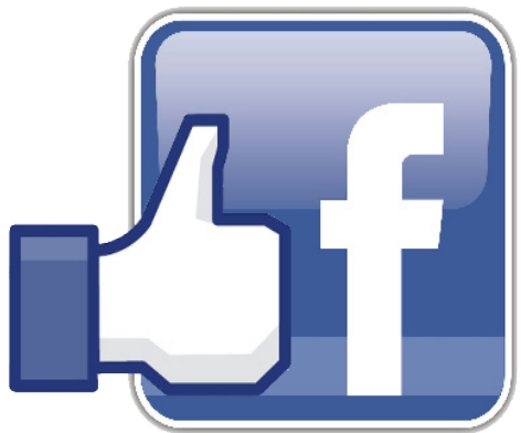
Like Festus R-VI School District on Facebook