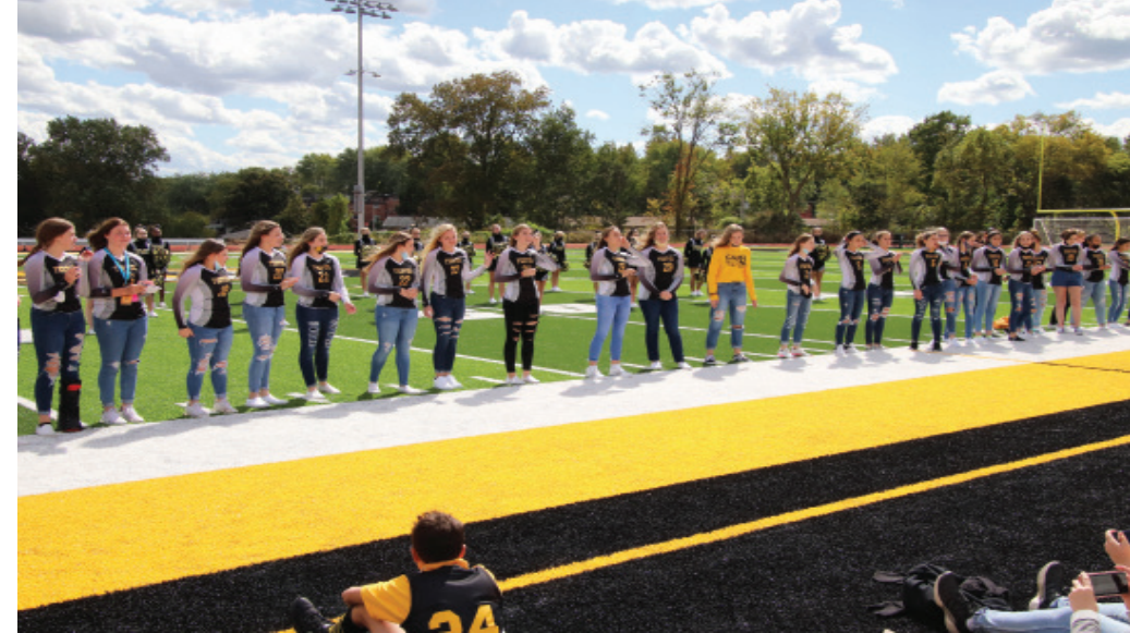
The Middle School volleyball team is introduced to the students